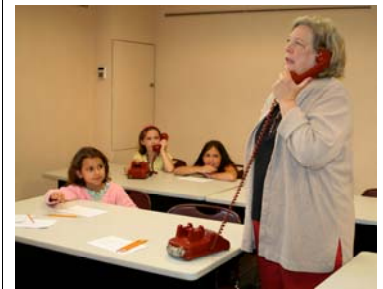
Mind Your Manners Class

Two part program: Tuesday, February 16 & Monday, March 1 6:30-9:00pm at Carrboro Town Hall. Ages 13-17. Free.